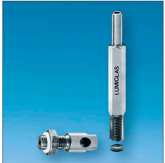
Lumiglas spray device