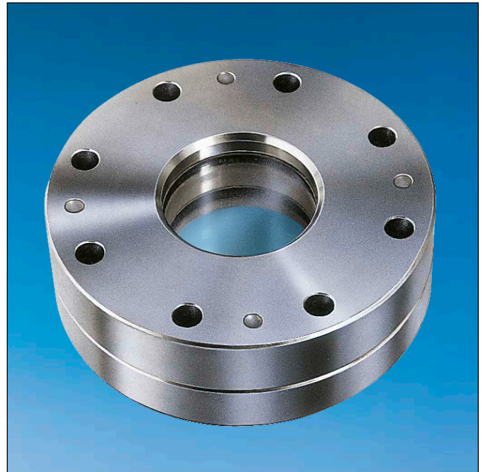
Lumiglas double glass safety sight glass fitting