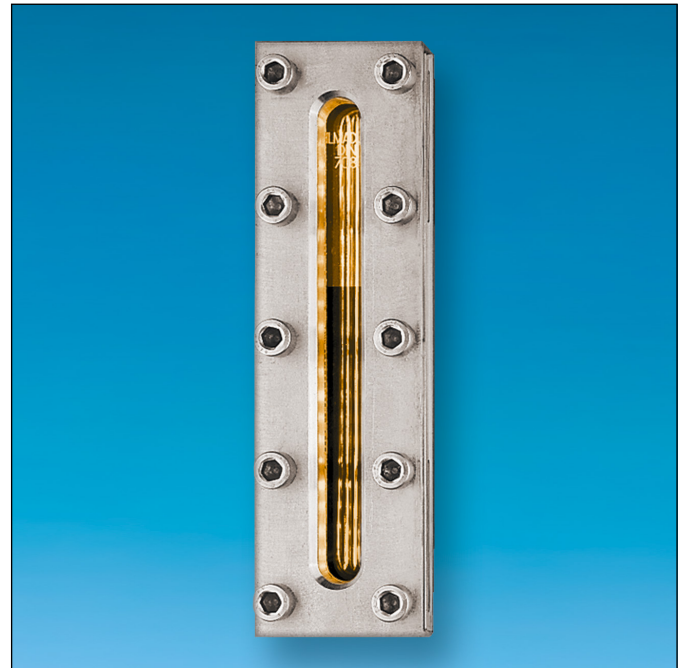
Complete assembly of a Lumiglas sight glass fitting rectangular

Progressively and carefully tighten down cover flange commencing with bolts in middle of flange and working outwards in crosswise alternating sequence (refer to sequence numbers 1-14 in illustration).