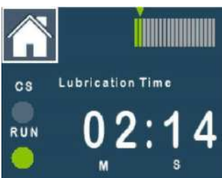
Lubrication time, shown in screen-saver mode. By swiping "Home" to the right, users can access the active mode