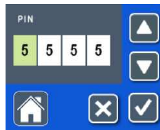
Password protection to prevent misuse or unintended changes