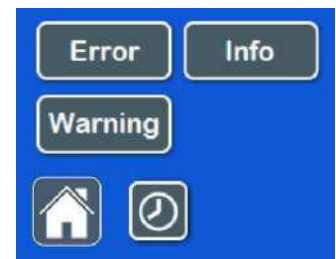
The log-book gives access to performance and failure message history as well as time stamps