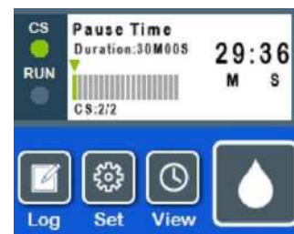
Pause time, shown in active mode, where users can interact with the pump