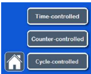
Setting of operation mode