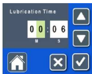
Setting of lubrication time