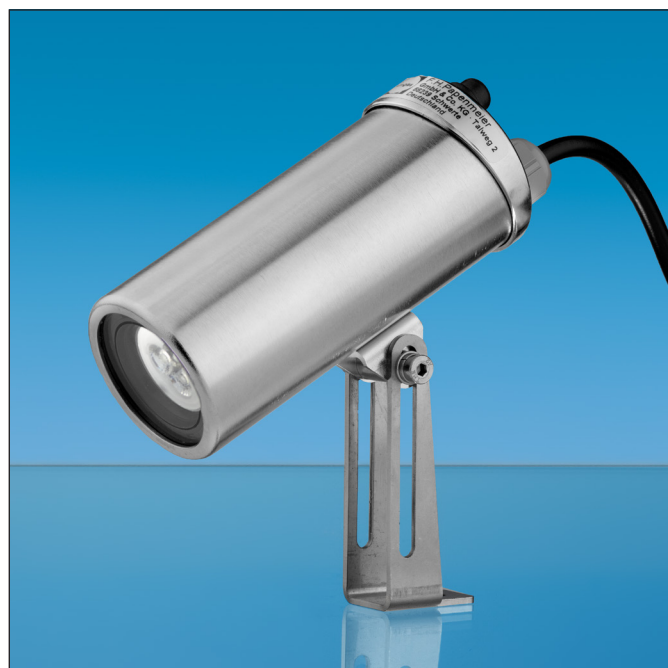
Lumistar luminaire USL 13-LED with hinged bracket