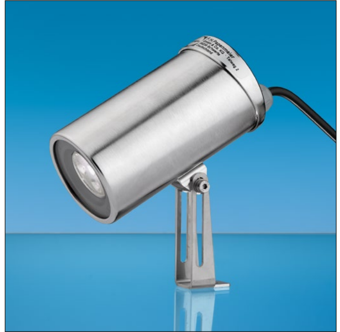
Lumistar luminaire USL 15-LED with hinged bracket