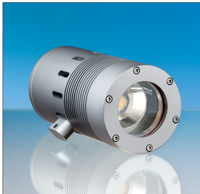
Lumistar luminaire ASL57LED-Ex