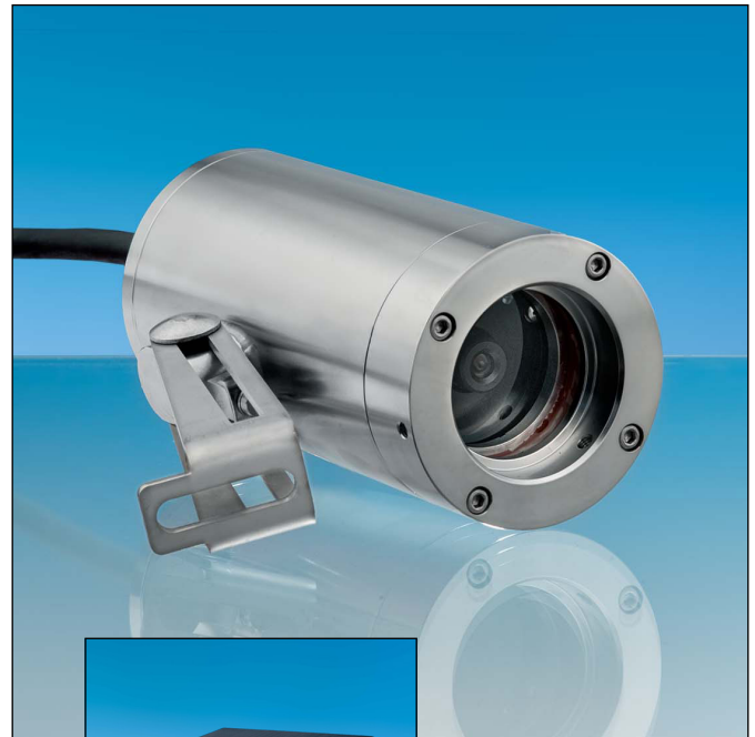
VISULEX Camera K55-P with fixed lens