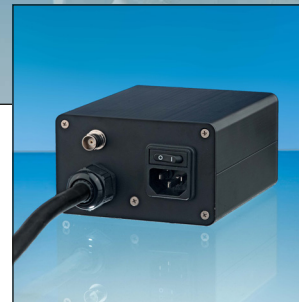
Terminal box for VISULEX camera K55P-Ex