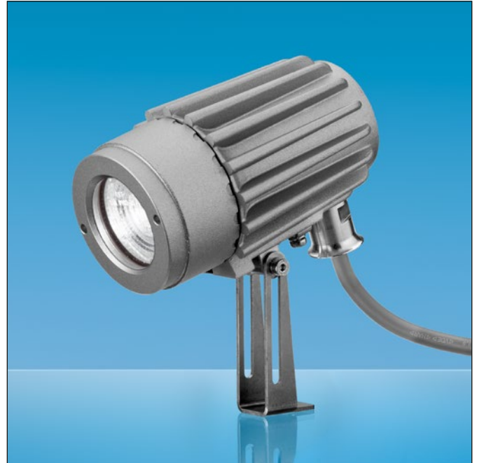
Lumistar luminaire USL 05LED-Ex