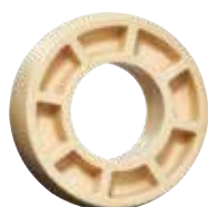
Standard UC series Metric ▶ Page 855