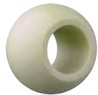
J4KM K series Metric ▶ Page 851