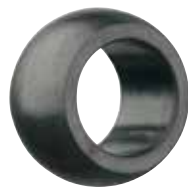
XEM E series metric ▶ Page 847