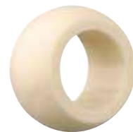
JEM E series metric ▶ Page 848