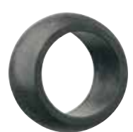
UWEM E series Metric ▶ Page 852