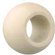
JKM K series metric ▶ Page 848–850