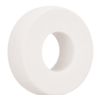
FDA-compliant UC series Metric ▶ Page 855