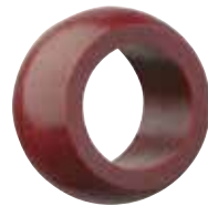
REM E series metric ▶ Page 846