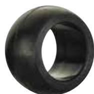
RN248EM E series Metric ▶ Page 854