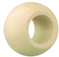
WKM K series metric/imperial ▶ Page 845