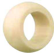
WEM E series metric/imperial ▶ Page 845