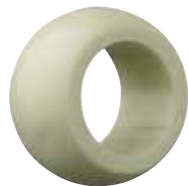
J4EM E series Metric ▶ Page 851