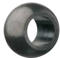
XKM K series metric ▶ Page 847