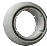
J4VEM E series Metric ▶ Page 853