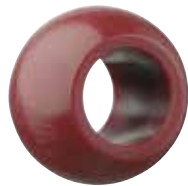
RKM K series metric ▶ Page 846