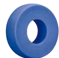
FDA-compliant, high temp. UC series Metric ▶ Page 855

844 Online tools and more information ▶ www.igus.eu/spherical-balls