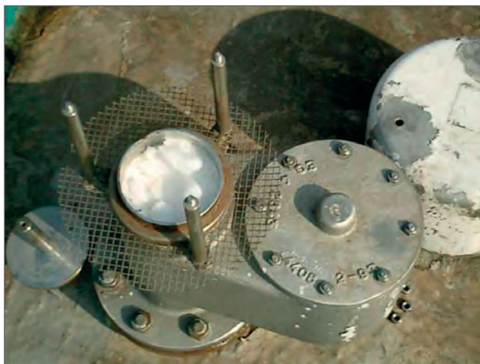
Clogging by crystallized acetic acid