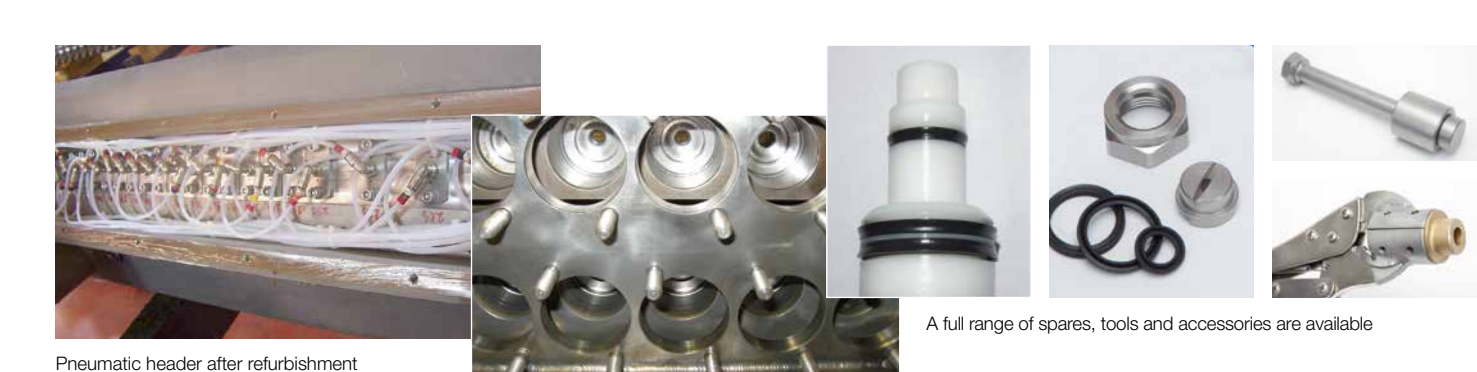
Stripped header after cleaning and pickling

Improved strip quality and increased productivity