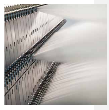
Header spray test prior to re-commissioning

Lechler keeps your quality up and your downtimes down. Our maintenance specialists take care for your mill's availability while parts are being refurbished at our work shops.