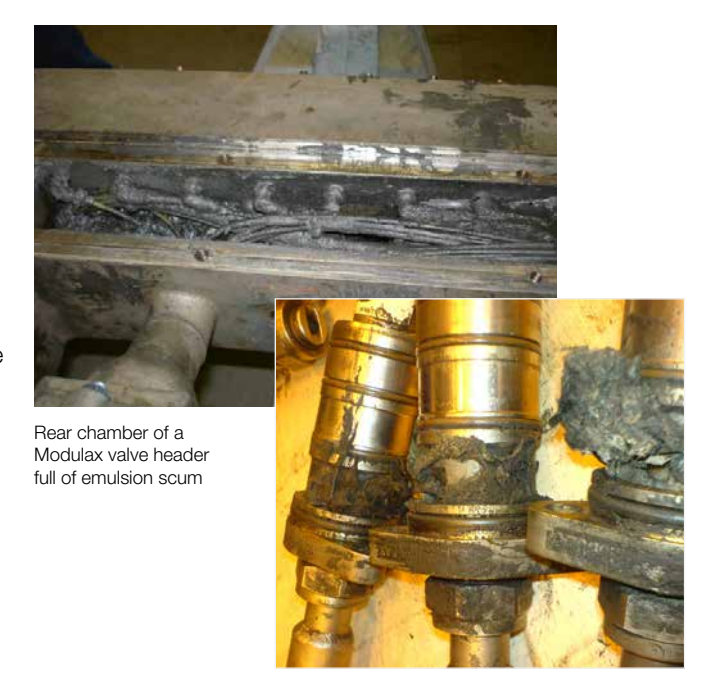
Modulax valves taken out of a badly polluted header. Valve entry ports are completely blocked.

Our main focus lays on plant life cycle service and support for our customers. This includes the supply of genuine spare parts, site inspection, repair, refurbishments or onsite maintenance, consulting and training for our selective roll cooling systems SELECTOSRAY®.