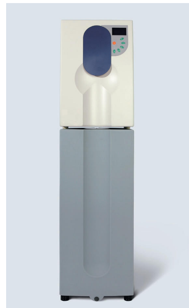
Ultra Clear RO System with 80 L tank

*: 115 V upon request; **: based on the RO membrane elements actually used